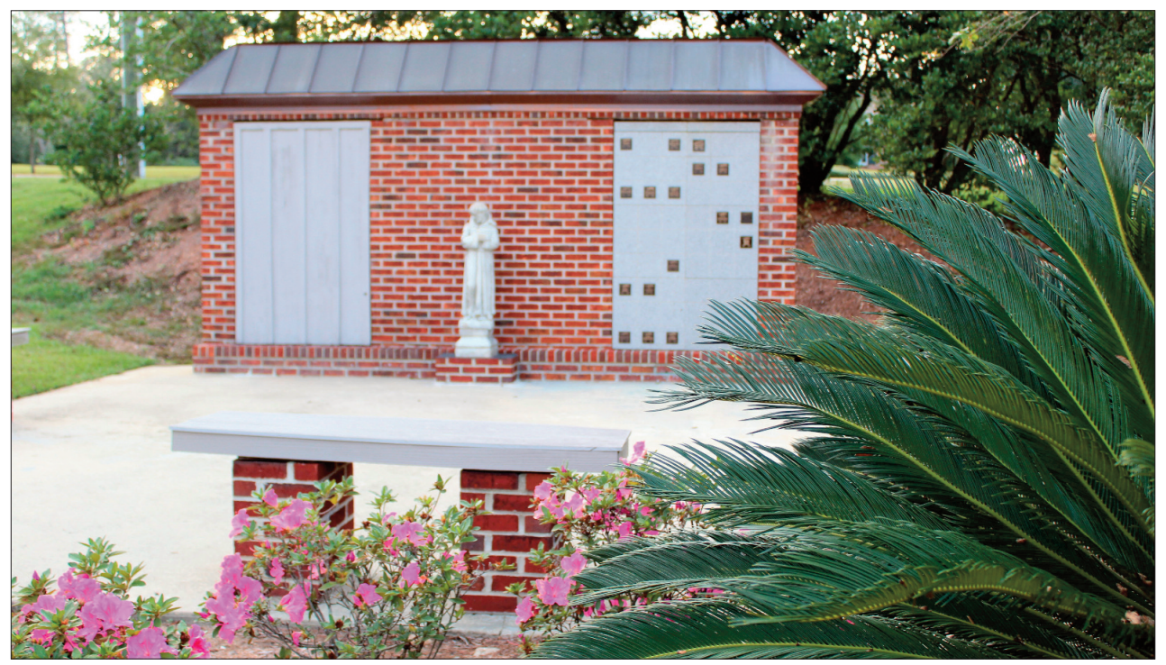
(Continued from the previous page)

aware of frugality in expenditures. When plans were being developed for the building of Grace House, a capital campaign entitled "A Time to Build" was initiated. That campaign had pledges and collections of $500,000 for costs of the building and ended in December 2018.